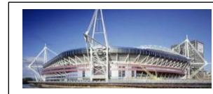
The Principality Stadium