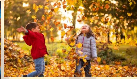
Playing outside in autumn is fun!