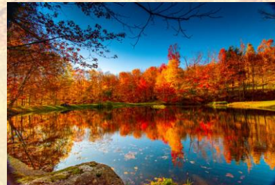
Autumn leaves changing colour

Autumn is one of the four seasons. It takes place in September, October and November . In autumn , leaves change colour as they begin to fall from some trees. Leaves change from being green and can become red, yellow, orange or brown . In autumn , conkers, leaves, pine cones and sycamore seeds can be found in our environment. In autumn some birds migrate to warmer countries.