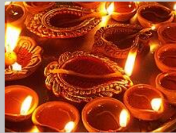
A diya lamp

People exchange gifts and cook food during the festival. They also create colourful patterns known as Rangoli on the floor and set off fireworks!