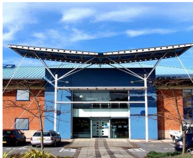
Burnley Brow School