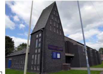
Church of St Mark, Chadderton