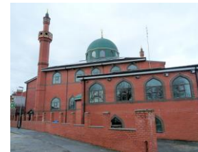
Central Jamia Mosque, Oldham