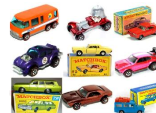
Match box cars