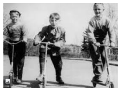
Scooters and bikes

Which games do you still play today? Which toys do you recognise?